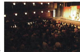
A theater used even now for Kabuki performances.

This theater building was constructed in 1887 next to the Hirose river that flows through the town of Yanagawa, and it was used for plays. Situated in the center of the stage is a revolving stage. Housed under the floor of the revolving stage is the equipment to operate this operating devices. The theater building was equipped with all of the other necessary facilities. Behind the stage were rooms used by the performers, and their graffiti remains on the walls of these rooms. As only a few older theater buildings of this type remain in the country, the Hirose-za Theater is one of the oldest of its kind, and therefore is an important historical building.