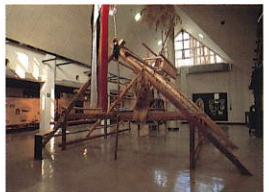
Interior of exhibition pavilion

With the aim of passing on every-day skills, you can learn how to create mats, sandals, and other items out of straw, and enjoy old-fashioned play.